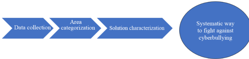
Figure 1. 4 Methodology of the Research.

The purpose of this present study is to explore how researchers fight against cyberbullying across disciplines to create a systematic approach based on the primary health care approach of the WHO. The approach is focused on “preventing illness and promoting health,” and it consists of five types of care, namely promotive, preventive, curative, rehabilitative, and palliative. In line with the conventional content analysis theory of Hsieh and Shannon [12] which is used to analyze the type of solutions offered by the studies of cyberbullying, a standard operational procedure for cyberbullying may be realized.